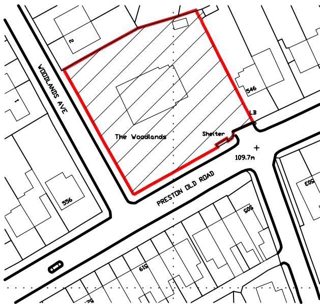
Site Location Scale 1:1250